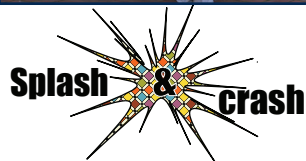
Successful 'Splash & Crash Holiday Programme