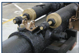
BELOW: I1 Gun completed refurbishment with fabulous brass features revealed.