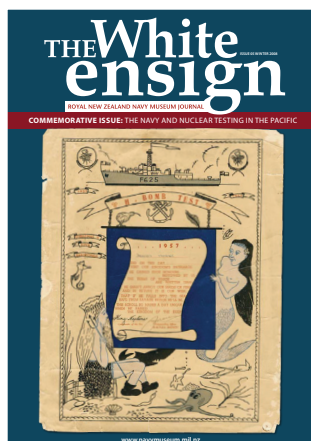
Preview of the Winter issue of The White Ensign Magazine