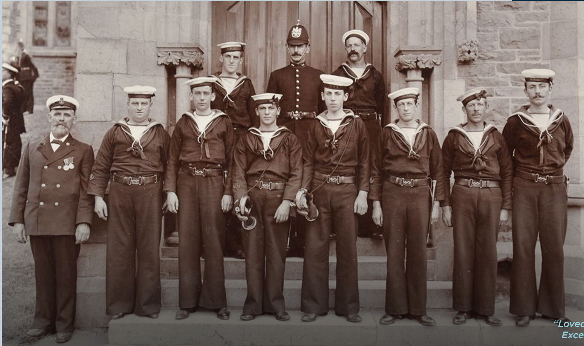
Lyttelton Naval Artillery Volunteers 1909, taken in Christchurch by Ballamey's, facing the Avon River across from Oxford Terrace. The sailors were being awarded their gunnery certificates at the Canterbury Provincial Buildings.