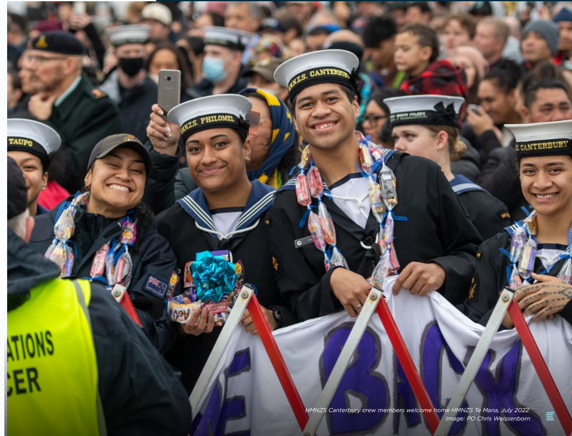
HMNZS Canterbury crew members welcome home HMNZS Te Mana, July 2022.