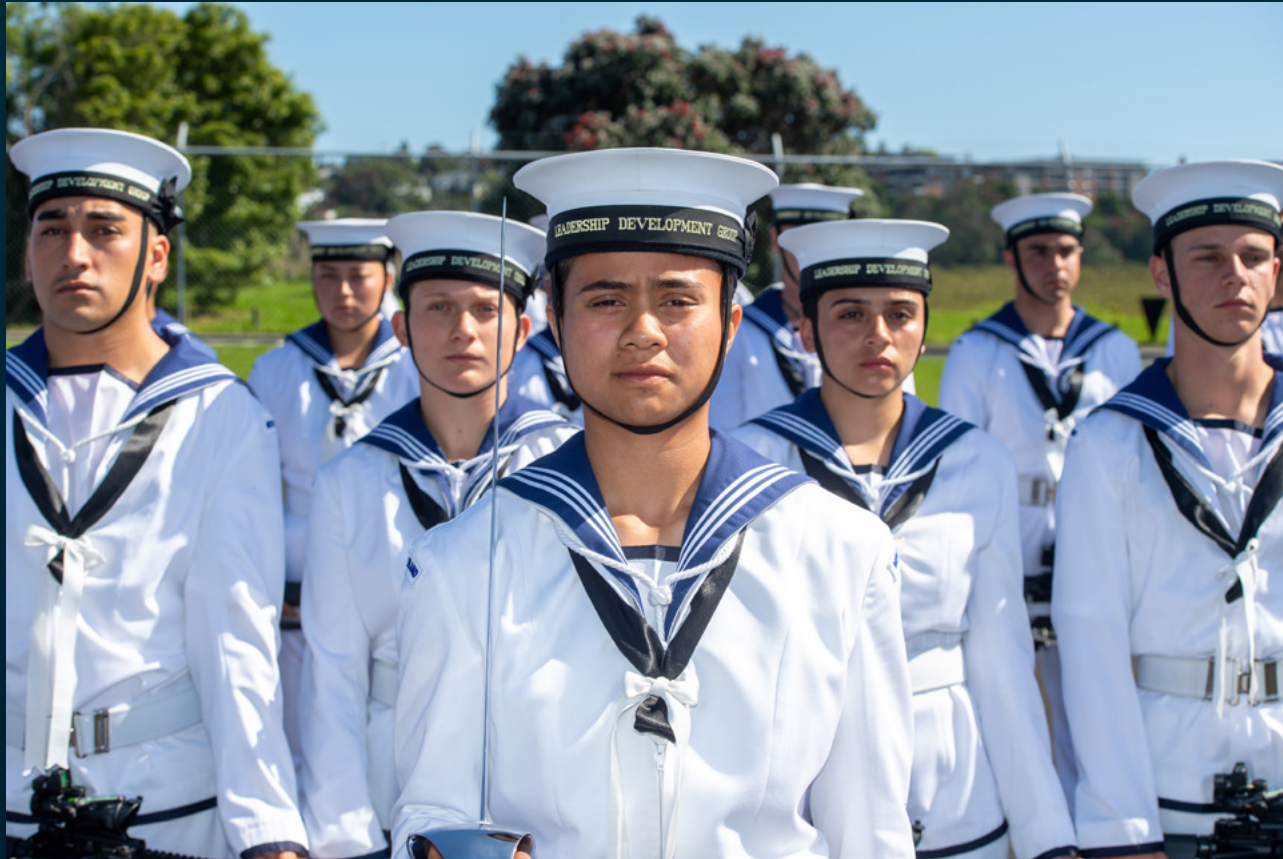
Basic Common Trainee and Junior Officer 23/2 Graduation, December 2023.