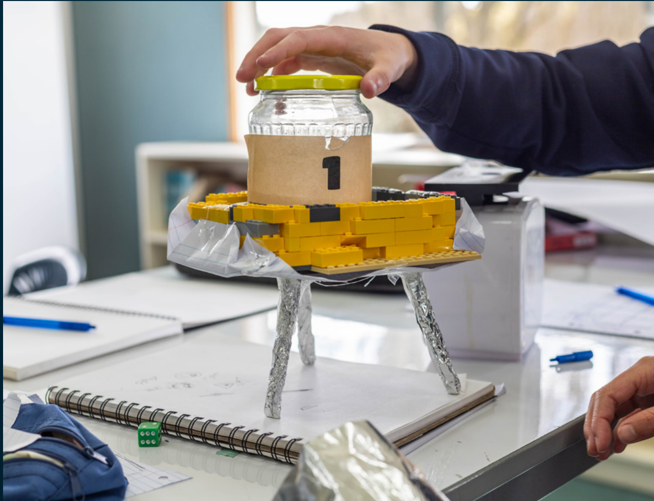
Science experiment underway at Belmont Intermediate School – September, 2023.