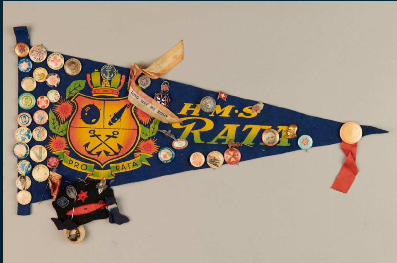
Pennant from HMS Rata – New Zealand Division minesweeper, decorated with buttons, badges, and mementos from the Second World War c1940. Object No: 2024.4.1

“This is an amazing centre to learn about the importance of the Navy. The way this centre has been arranged in order to showcase artefacts, history, involvement, importance and partnerships between countries is phenomenal.”