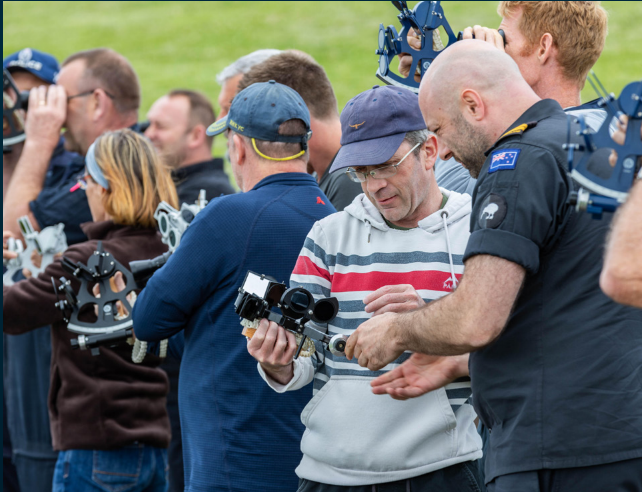
Navigate with the Navy Workshop December, 2023.