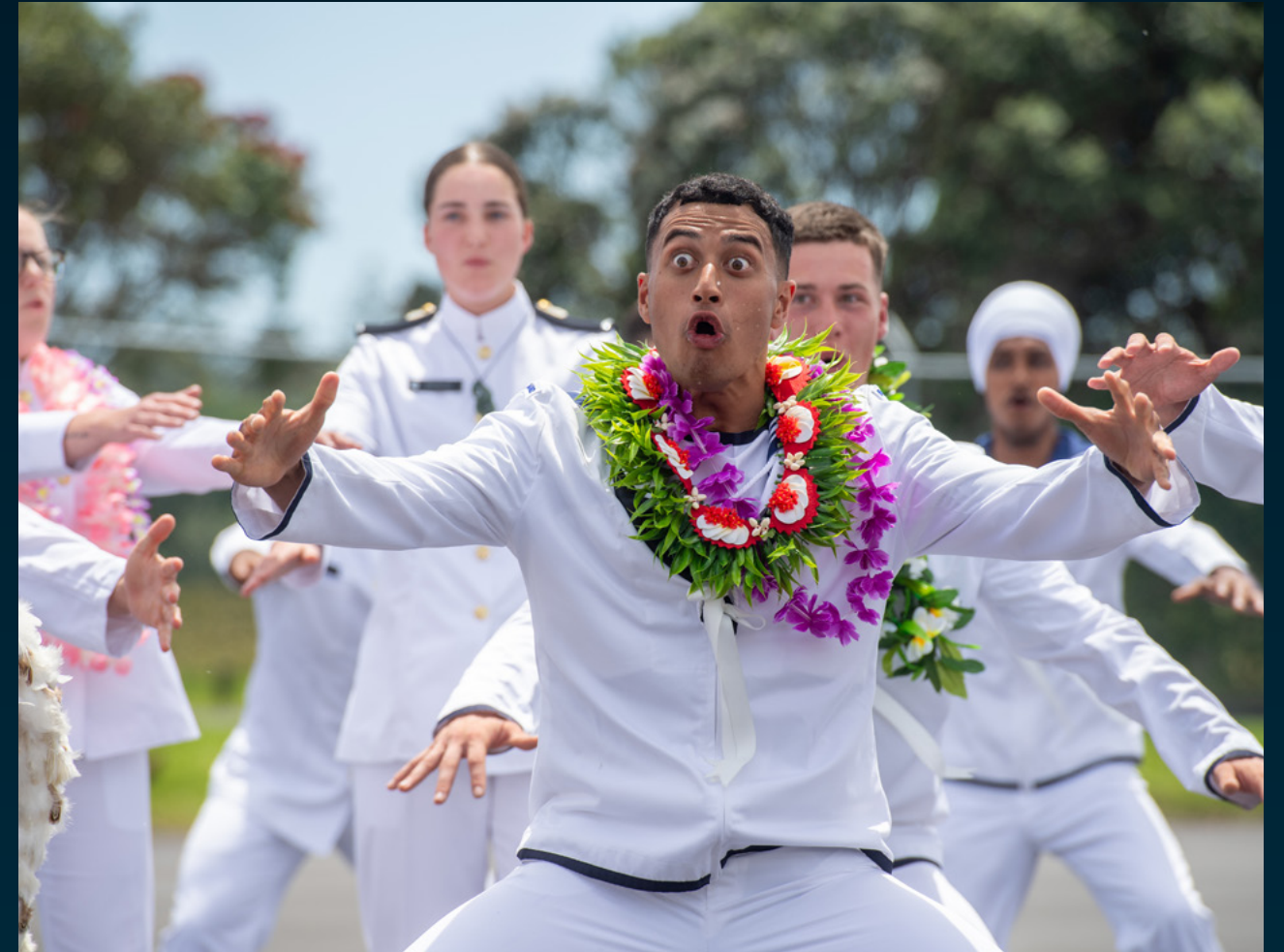
Junior Officer and Basic Common Trainee 23/2 Graduation December, 2023.