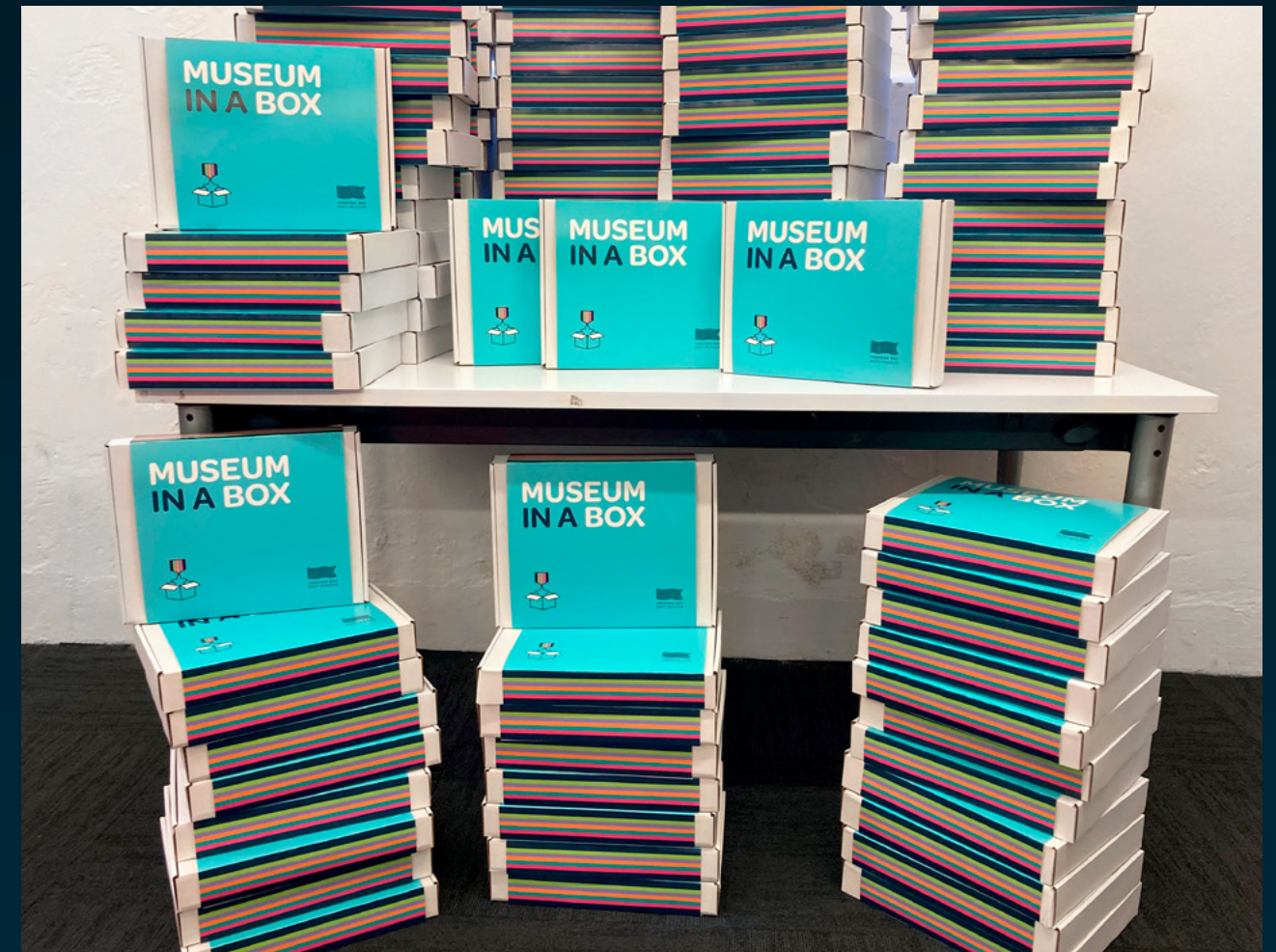
Museum in a Box – Medals ready to be posted out to schools around the country.

Teacher who used Museum in a Box – Medals